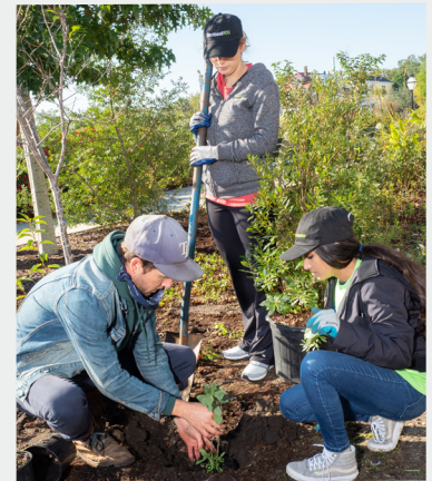
Blackbaud employees volunteering at Blackbaud's Day of Service, 2018 at Charleston Parks Conservancy, Charleston, SC.

By focusing wholly on this vital and underserved market, Blackbaud has built not just a successful business model, but an innovation engine that has played a role in driving advances on social issues of every kind.